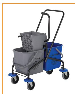
Double Mop Bucket w/Press

*Gloves Brand and Pricing are subject to change.