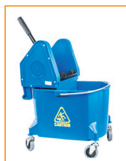
Combo Ringer Mop Bucket